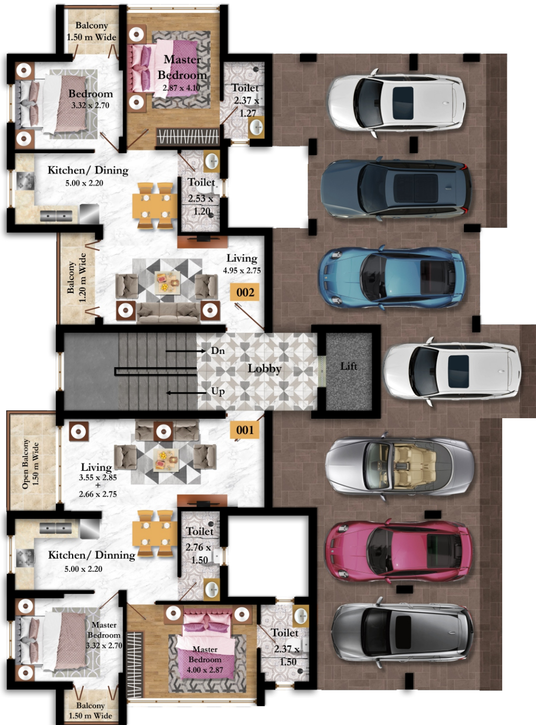
Upper Ground floor Plan