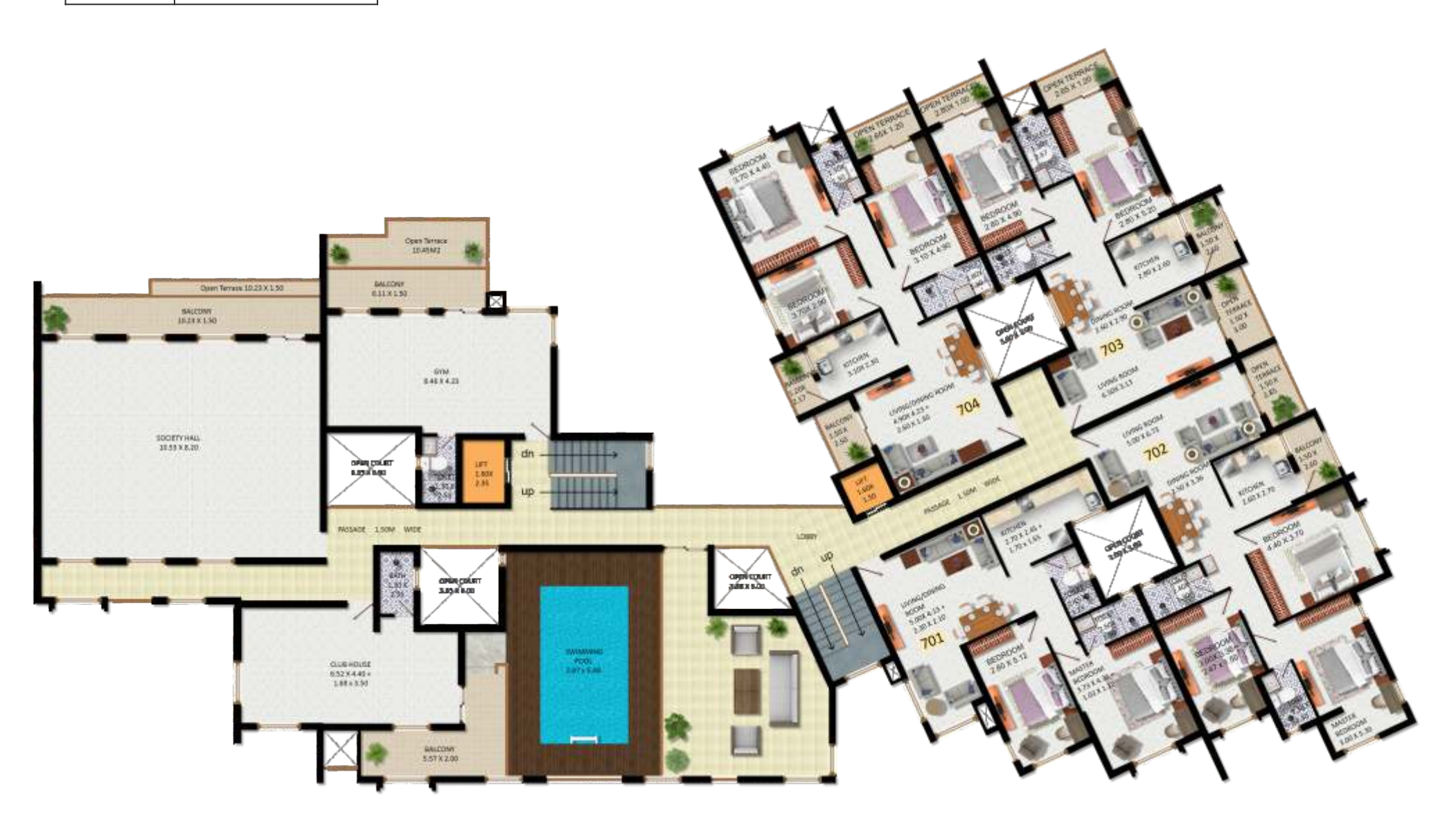
7th Floor Plan