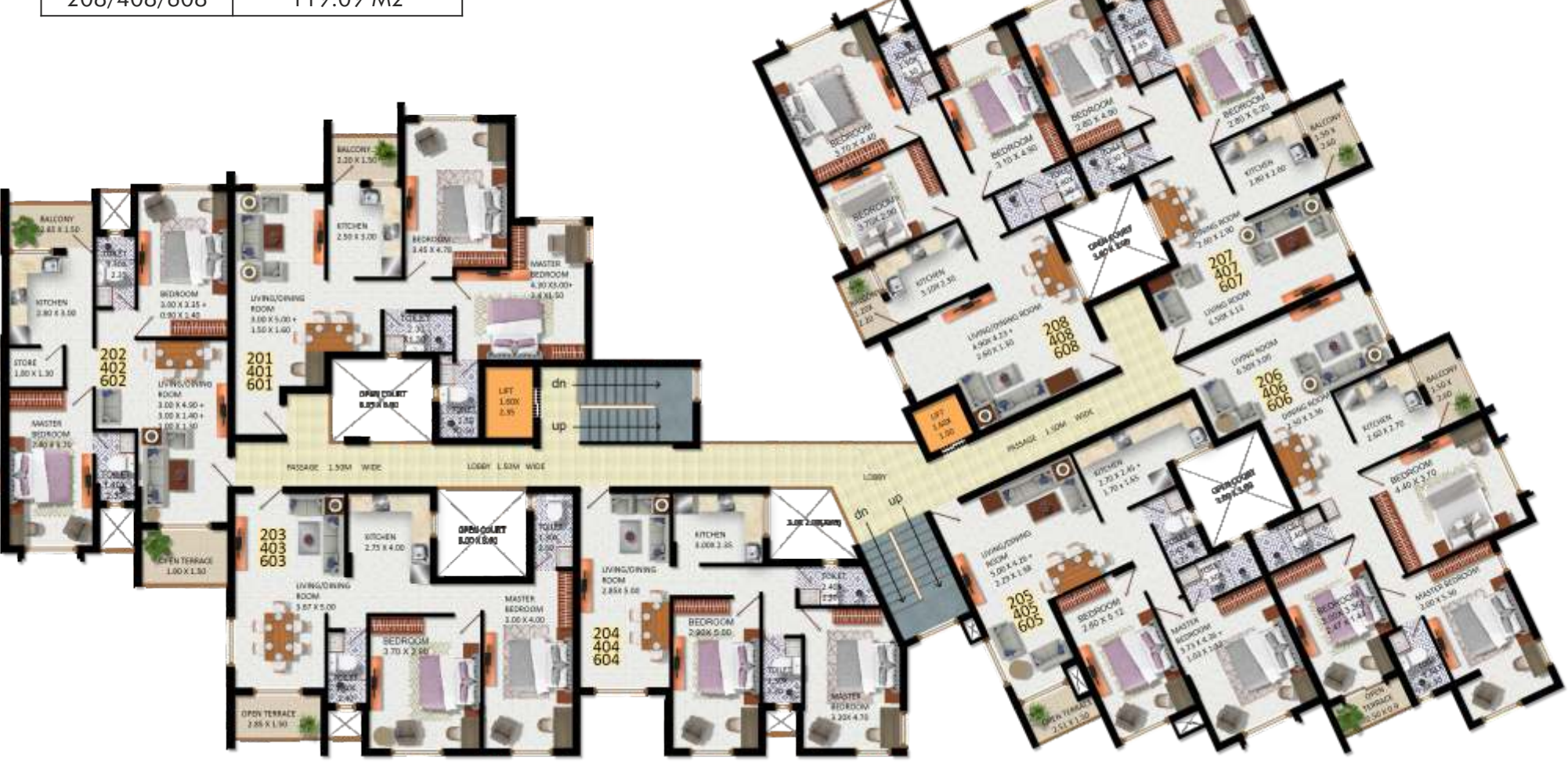
2nd, 4th & 6th Floor Plan